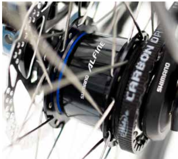
Internal hub gear