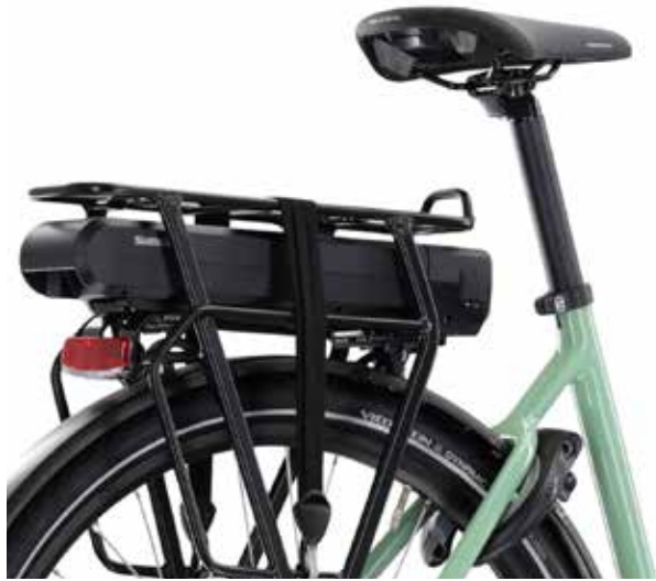
Battery on rear bike rack